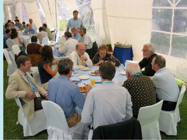
Oaxaca, November 2005