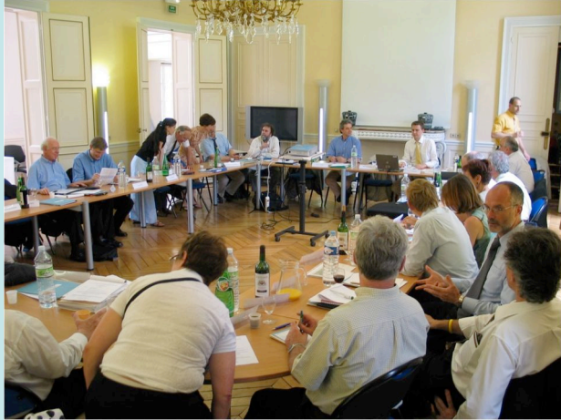
Paris, June 2005