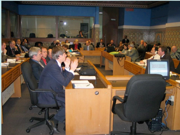
Montréal, December 2005